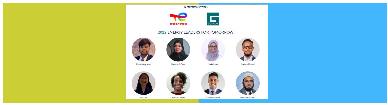
Written on 13 September 2022