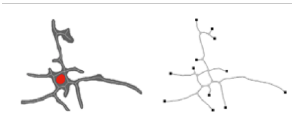
Illustration of skeleton calculation and analysis of the fungus

The tool is used in conjunction with a specific skeleton segmentation and calculation approach in order to conduct extensive morphological and topological analyses, with the entire procedure included in a totally automated image processing method, making it possible to analyze a greater number of images than traditionally reported in the literature.