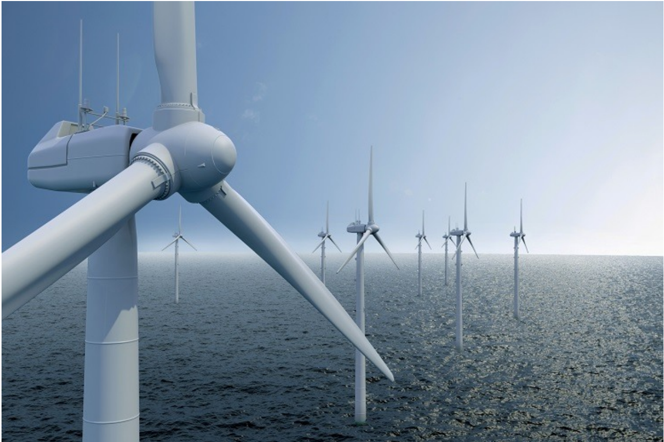
An offshore wind farm

onshore equivalent but they are likely to fall over time.