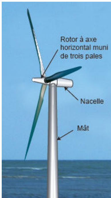
The components of a wind turbine

been designed: with these, the generators operate with a variable rotation speed (5 to 2,000 rpm) and do not use a multiplier. The assembly composed of the multiplier and the generator forms the nacelle.