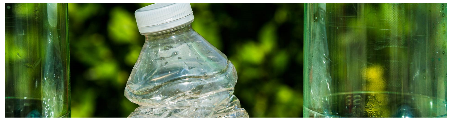
Written on 27 February 2019