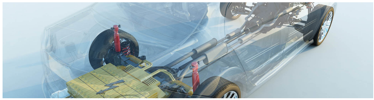
Written on 11 June 2019