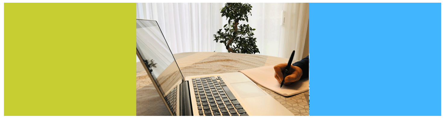
Written on 04 November 2019